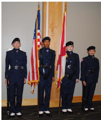
Bob Jones AFJROTC Color Guard